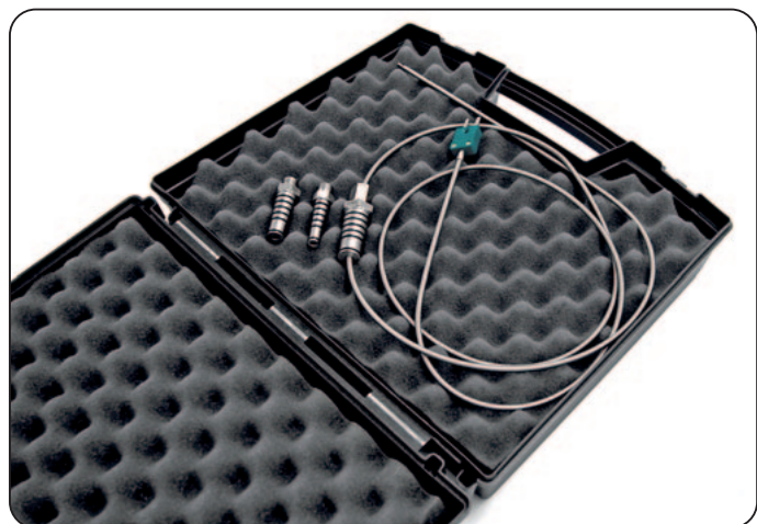
Dipstick thermocouple with sealing inserts is delivered in a case.